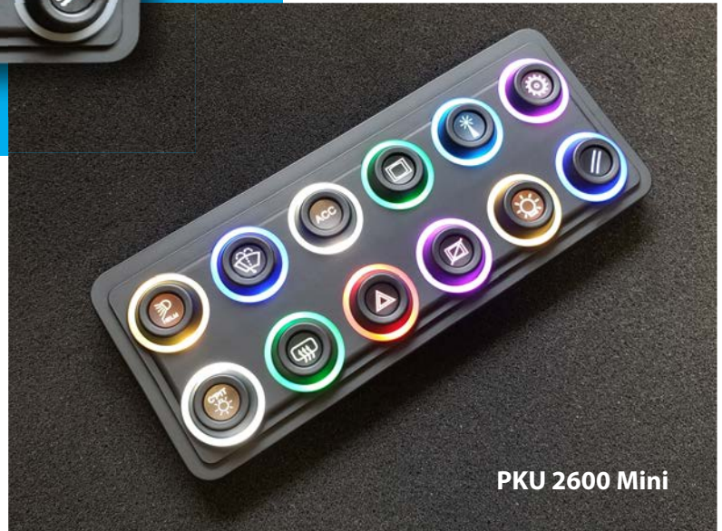
PKU 2600 Mini