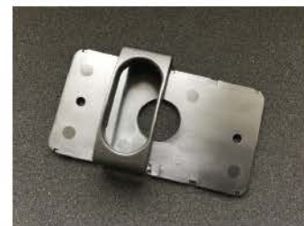
OPTIONAL FINGERGUARD & BACK-PLATE